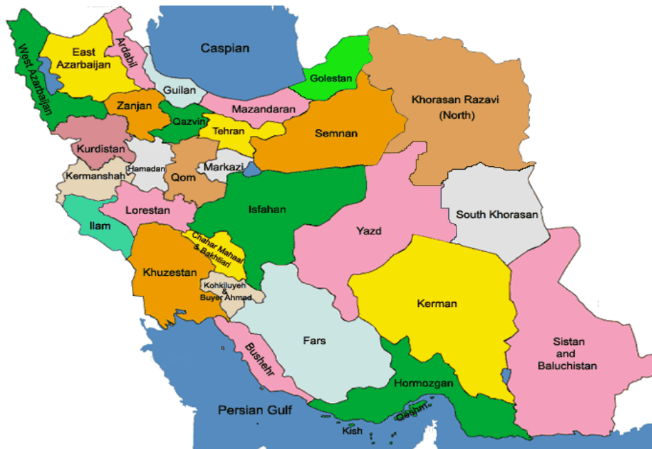
Figure 1: The site of the three Alternatives on the map of Iran

There are rich sources of agricultural residues in the north of the country and this reduces the cost of raw materials transportation. Also, to protect forest, the construction of new particleboard plants using agricultural residues in the north of Iran is economically justified. Table 1 shows the area under cultivation of crops in the three provinces and the total area in the country during the period of 2005–2010 (Ministry of Agriculture, 2012).